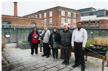
Synergy, our speaking up group for people with learning disabilities

User involvement is making sure people are able to actively shape and improve the services they use and influence local and national policy. People who use services have first-hand experience, know what they need, what works well and what does not. They should have the opportunity to be involved in every aspect of the services they use – from their individual care and treatment, to the management, planning and evaluation of the services they receive. We run user involvement projects that work with people with learning disabilities, people using or wishing to use mental health services and older people.